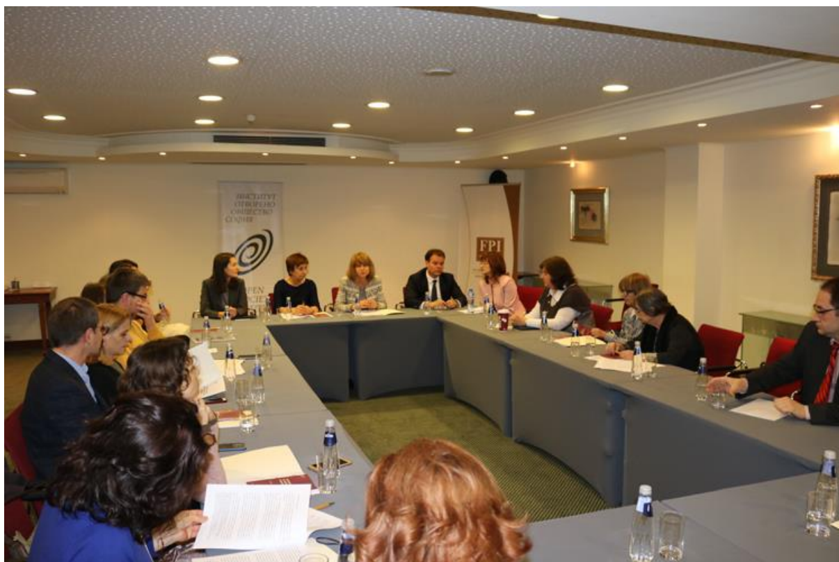
Presentation of the report What We (don't) Know about Prosecutors General in the EU Member States

Since 2019 the Legal Programme has been implementing another research project on the transparency and accountability of the institutions of the judiciary. The study aims to establish whether at all and to what extent the media influences the detection and successful prosecution of the misappropriation of EU funds in Bulgaria. In order to answer this question, the study shows the practical dimensions of the term used by the prosecutor's office cases of particular public interest – which cases attract most media attention and why, which the most frequently reported violations and crimes are, in how many of the cases the law enforcement authorities take action to establish the alleged violation or crime and what their reaction regarding to the media interest in the issue is. The research method consists of analysis of the content of news texts of three media within a three-year period. The study had been funded by the Ministry of Foreign Affairs of the Kingdom of the Netherlands and was carried out in the period September 2019 – April/May 2020.