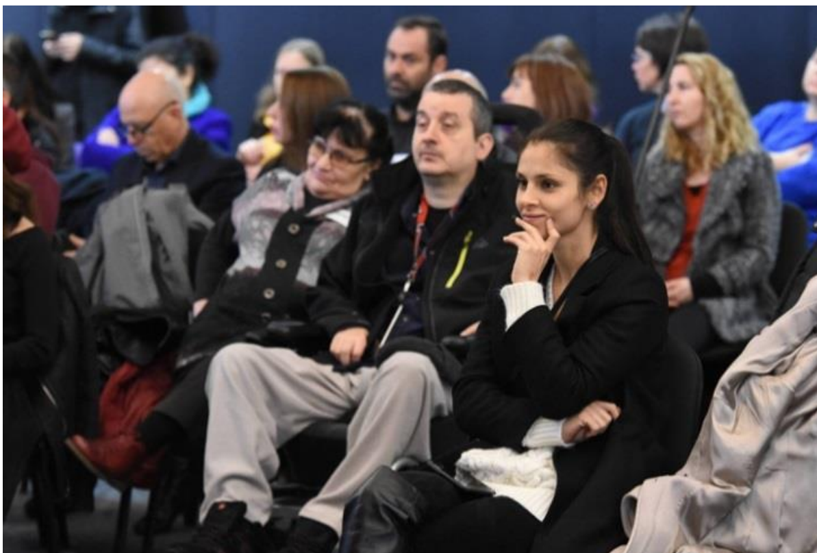
Sofia, December 5, 2019, annual meeting on Communication of Civic Organizations – Possible Solutions, Active Citizens Fund Bulgaria

In 2019, OSIS launched the predefined Project Generation Facility (PGF) which is a specialized mechanism for support of civic organizations working for the equal inclusion of the Roma. The PGF provides free consultation services for the development of good ideas, including coming from organizations with limited capacity in order for them to fully develop and implement their initiatives with funds of open funding programmes outside the Active Citizens Fund Bulgaria.